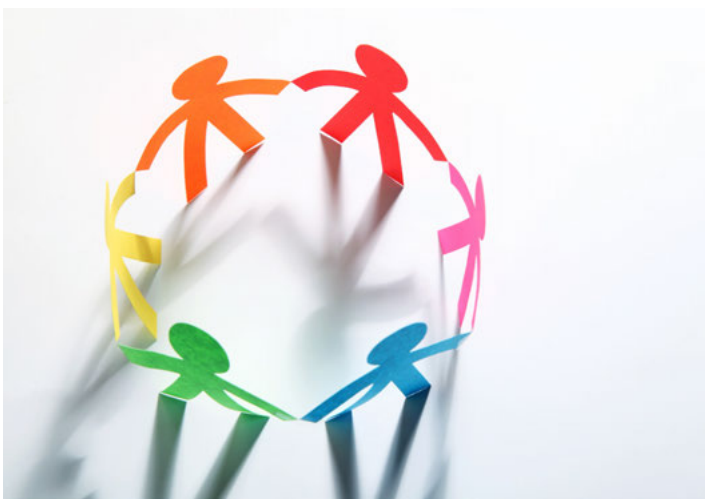
Code of Conduct